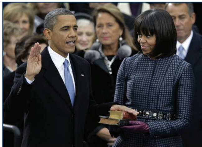
President Barack Hussein Obama II takes the "Oath of Office" on his wife's family Bible Capitol Hill Washington, DC, USA – 21st January, 2013.

The implications of this decree are clear and unequivocal: for as long as God lives (and that's forever!), His covenant with Abraham (and subsequently Israel), will stand secure – eternally! (Cf. Heb. 6:13-20; Ps. 105:7-11). Israel's Messiah would ultimately come, fulfilling His salvific role at His first Advent, and based on that redemptive, substitutionary, atoning mission, He would fulfil (in time) His Prophet, Priest and Kingly role at His Second Advent in establishing His Kingdom